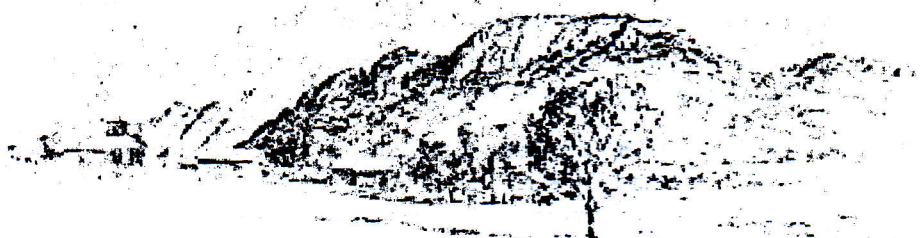
Sketch by Iain Renton Mt Moon