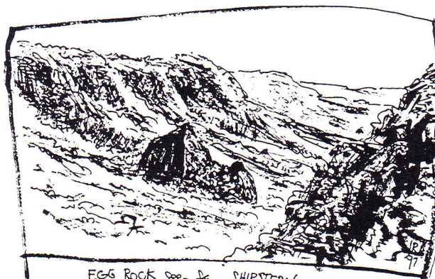
EGG Rock seen from SHIPSTERN

Sunday morning we put away dry tents and walked through some pleasant rolling ridge lines to Grass Tree Knob and then Kangaroo Mountain for morning smoko. The top of Kangaroo is absolutely beautiful, large stands of eucalypts with native grasses and ferns covering the top. Just before midday we caught up with the day walkers in the Castle Kangaroo saddle where very gratefully they had brought us up some water. At this point Trevor hit a pot hole with his ankle and came off second best, luckily an ambulance officer was at hand to render first aid while the rest of us either poked fun at him or looked for suitable material to build a tombstone out of. Maybe Trevor made a good