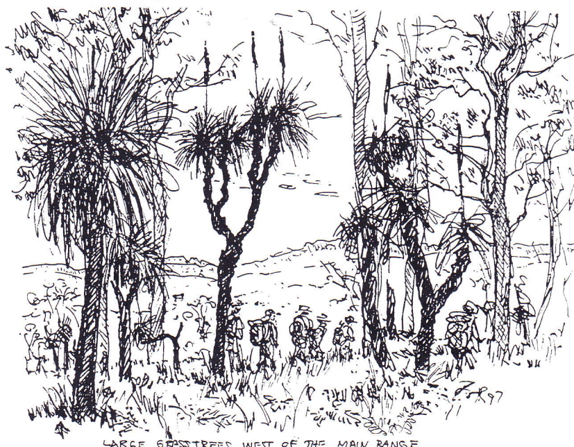
LARGE GRASSTREES WEST OF THE MAIN RANGE