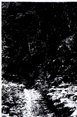
▲ Spicers Gap road, a reminder of colonial engineering and early pastoral settlement, is now protected in a conservation park on Main Range south-west of Brisbane.

Thank you to all who contributed to this month's magazine. Happy reading.