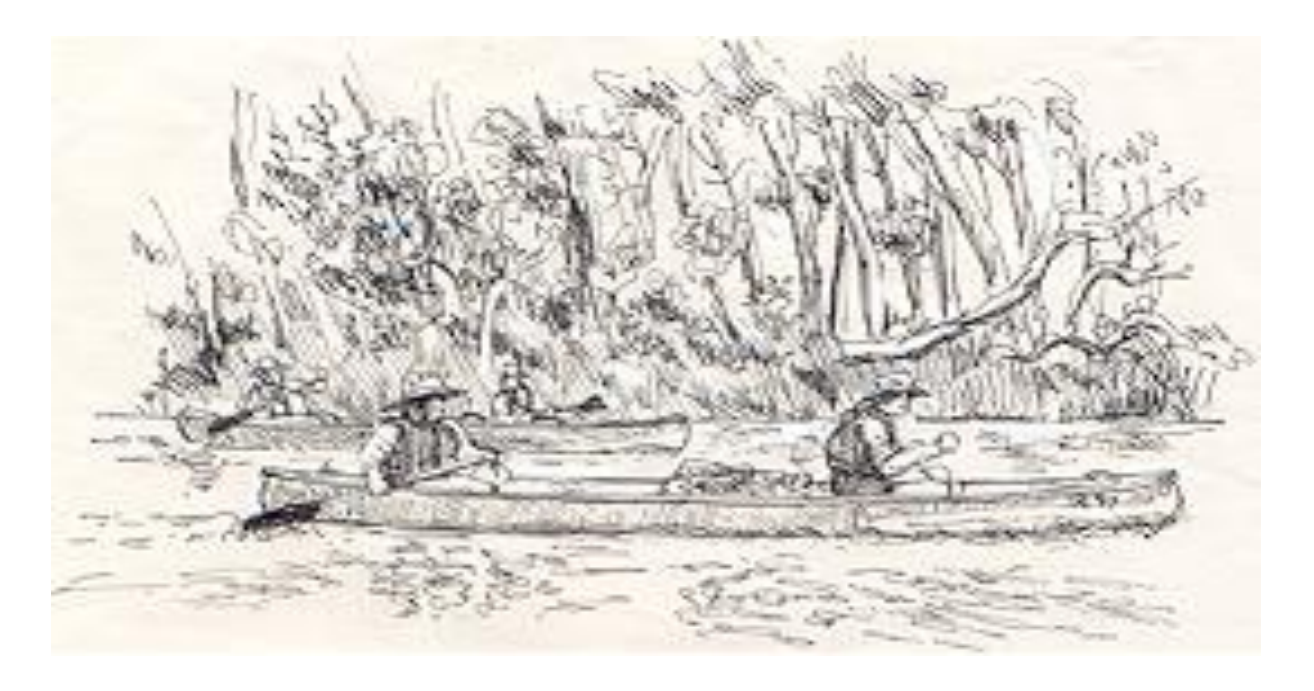
Sketch by Iain Renton

The club's calendar can be seen at this site under the heading Event Calendar. (The web site can be located through the Yahoo search engine. Also, there are links from the Federation website.)