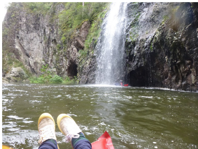
The Waterfall at the Narrows Gorge Benno is Under the Waterfall

Bring a lilo, wear thermals for sun protection and bring some food for a great day out. Bring either a dry bag (cost about $40) or 3 garbage bags to use as water proof bags to go inside your back pack. I highly recommend wearing Dunlop volleys as footwear and garden gloves for your hands as your hands get very soft after a few hours in the water. Please note, the trip is great fun but it has an serious element of risk and you need to be aware of the danger as we will be in moving water and there is a risk of drowning. Yep it can be very serious.