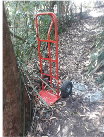
An Interesting Piece of Junk Left Behind on the Nightcap Track

'Before it became a national park, it provided the historic link between the Richmond and Tweed valleys known as the Historic Nightcap Track. It provided the first bridle track in 1871 and as of 1874 a telegraph line between the two valleys. A section of this historic link is now part of a walking track at the park.